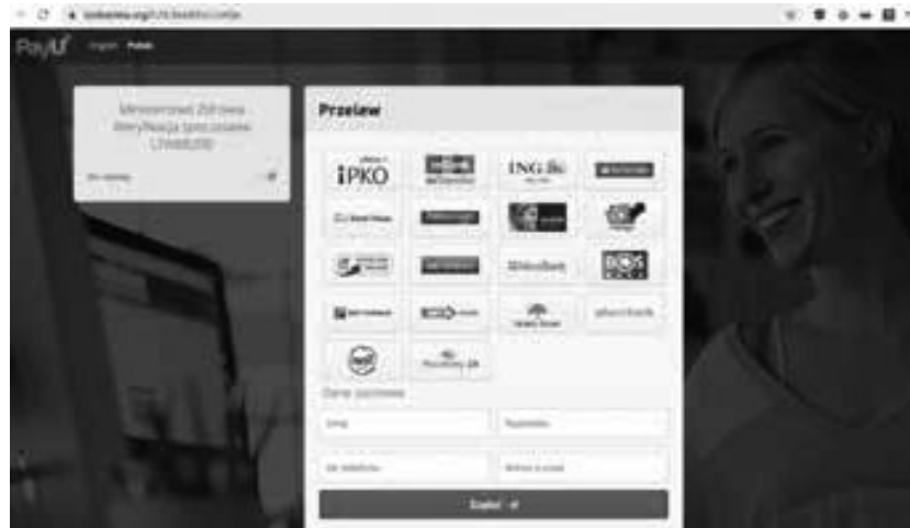
Graphic 5. Print screen from the Zaufana Trzecia Strona website.