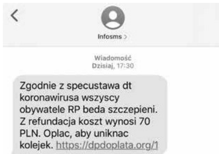
Graphic 6. Print screen from the Zaufana Trzecia Strona website.

On the same day, another campaign emerged to defraud bank customers (graphic 6).