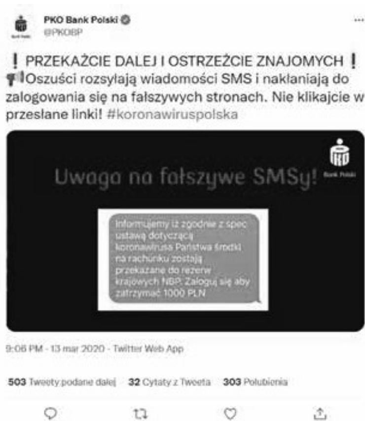
Graphic 4. Print screen from Twitter account of PKO Bank Polski.