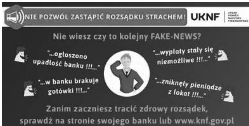
Graphic 7. Print screen from the Twitter account of the Office of the Financial Supervision Authority.