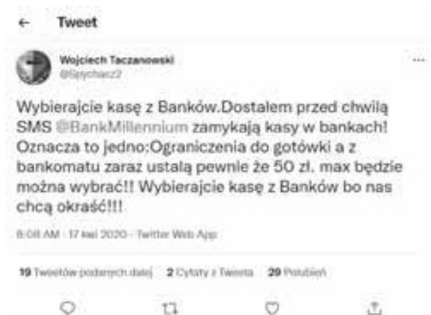
Graphic 3. Print screen from a social media account on Twitter. Fake news regarding cash withdrawal restrictions at Millennium Bank.

The last type of information disseminated with great frequency in times of the epidemic threat is fake news about problems with cash availability at ATMs and bank branches. To fairly describe the phenomenon under analysis, it must be acknowledged that indeed - due to the restrictions imposed, the scale of cash withdrawals, and the fact that banks were also experiencing staff shortages due to the COVID-19 pandemic, there were temporary problems with timely delivery of cash to ATMs. However, this had nothing to do with the reasons indicated in alarmist posts made on social media. However, every now and then, new information appeared on the web that there would be a shortage of cash due to the pandemic (graphic 3).