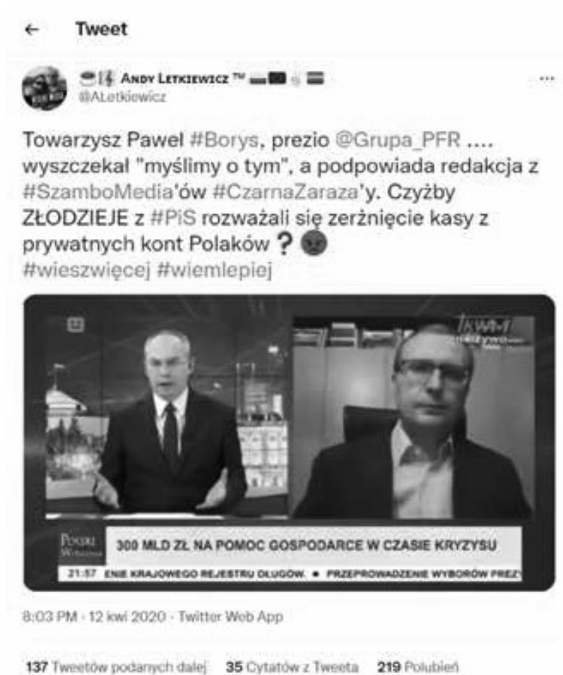
Graphic 1. Print screen from a social media account on Twitter.

private accounts of Poles? 60 (graphic 1). The tweet gets 150 “follows” and 236 likes. According to the content of the tweet, the government’s goal is to “steal money from the private accounts of Poles.” This information triggered an avalanche of further fake news, which, as we will discuss later, was used by journalists, politicians and news portals, among others.