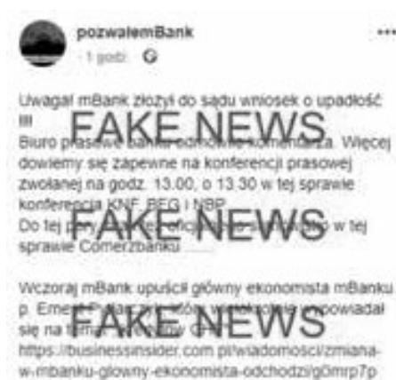
Graphic 2. Print screen from a social media account on Twitter.